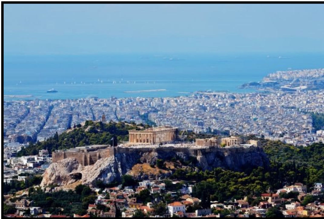
Foreground: The Parthenon Atop the Acropolis; Background: The Piraeus