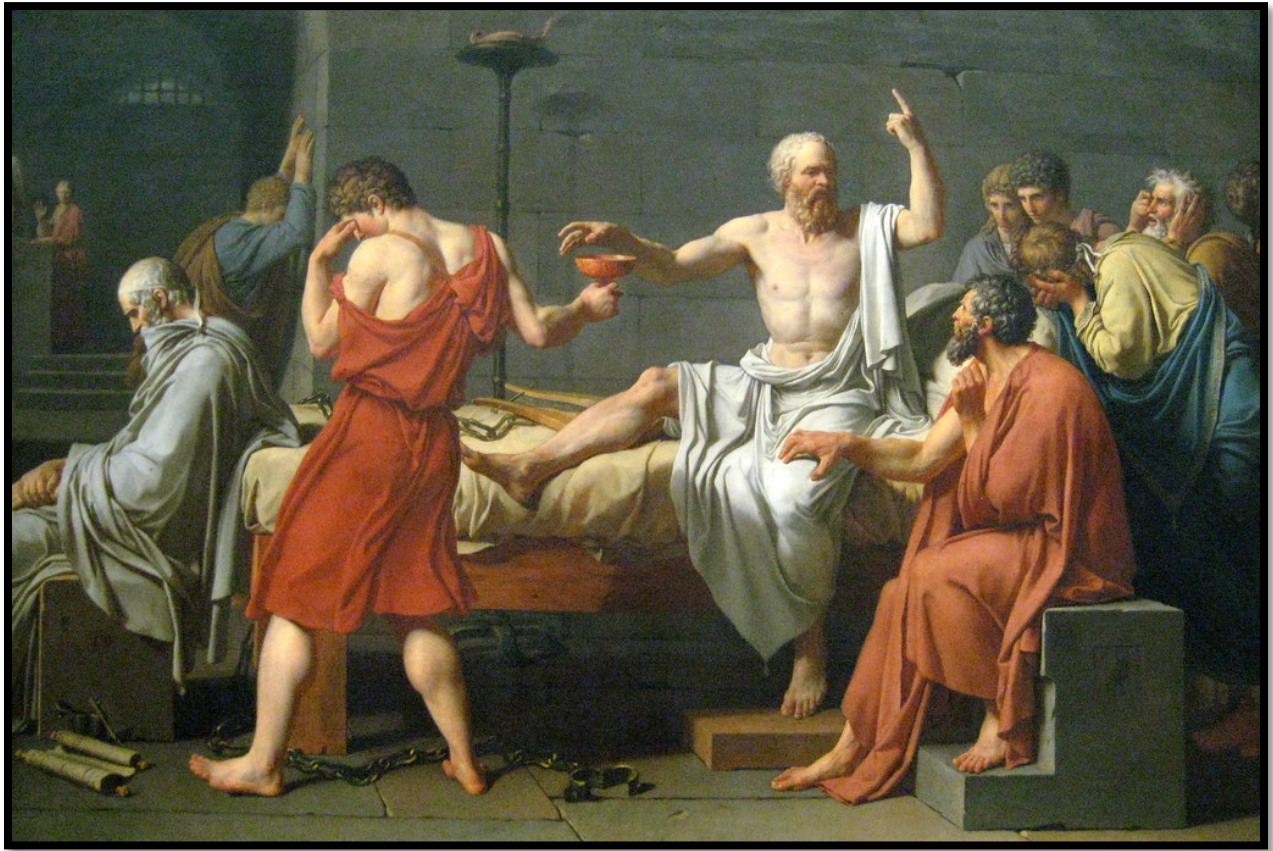
The Death of Socrates by Jacques-Louis David 1748-1825